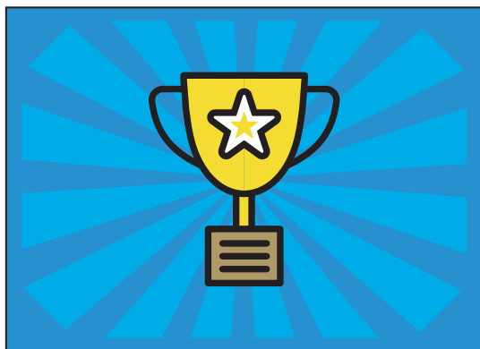
SENTENCE CARDS (X42)