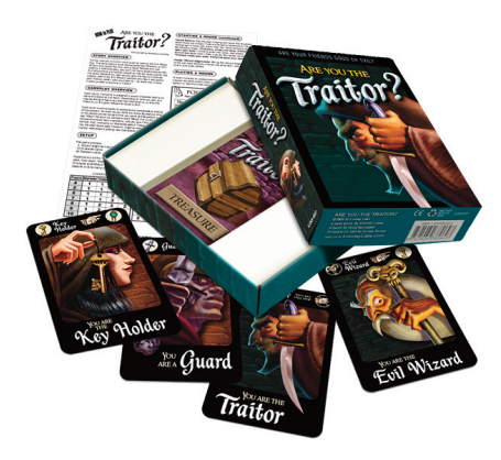
Are You the Traitor?